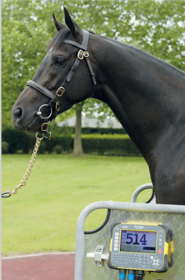
Bluetooth JR5000 read out unit